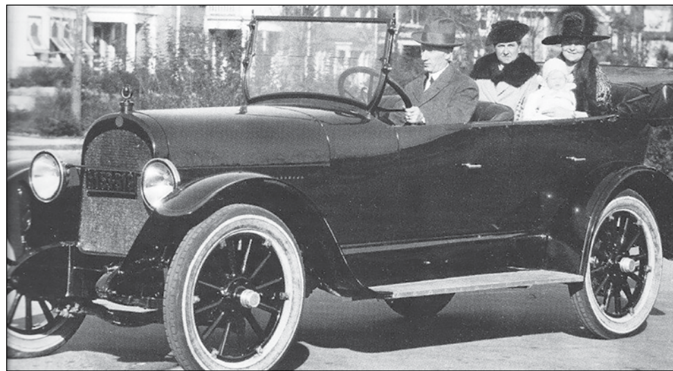
The only 1921 Brock Six built in Amherstburg.