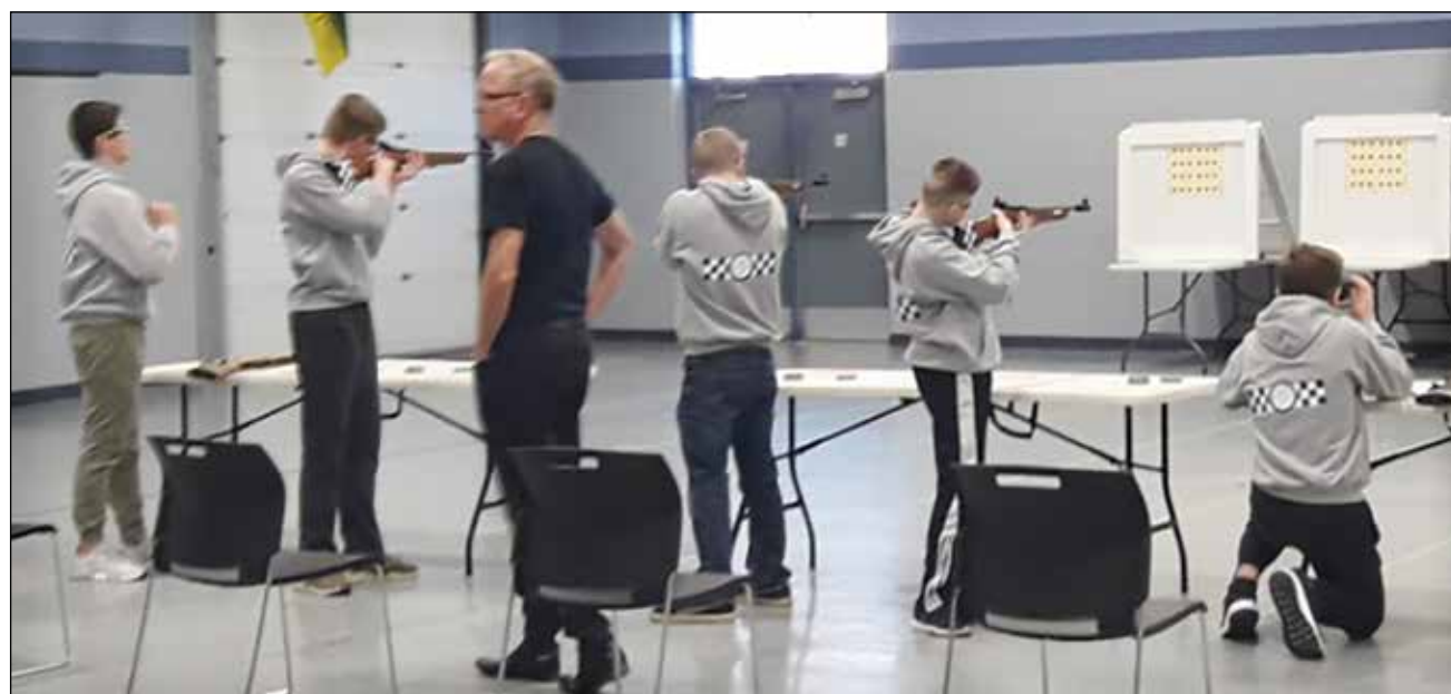
Pictured are members of the 535 Air Cadet Squadron of Leamington as they compete at the RSU Cadet Zone 1 Marksmanship Competition in Windsor on the weekend. The squadron placed third overall.