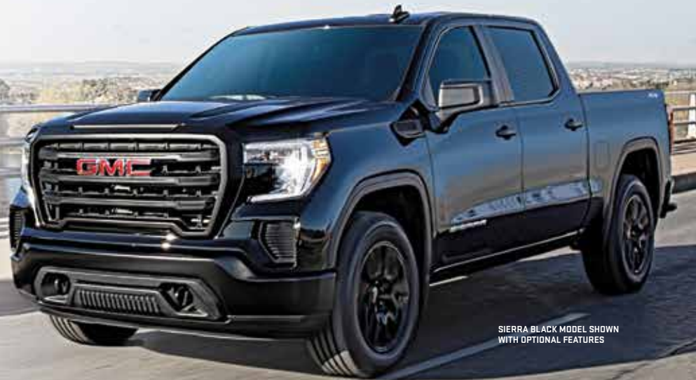
SIERRA BLACK MODEL SHOWN WITH OPTIONAL FEATURES

2020 SIERRA 1500 CREW CAB BLACK EDITION LEASE FOR $158 BI-WEEKLY, THAT'S LIKE $79 AT 1.9% FOR 24 MONTHS WITH $2,900 DOWN PAYMENT* WEEKLY